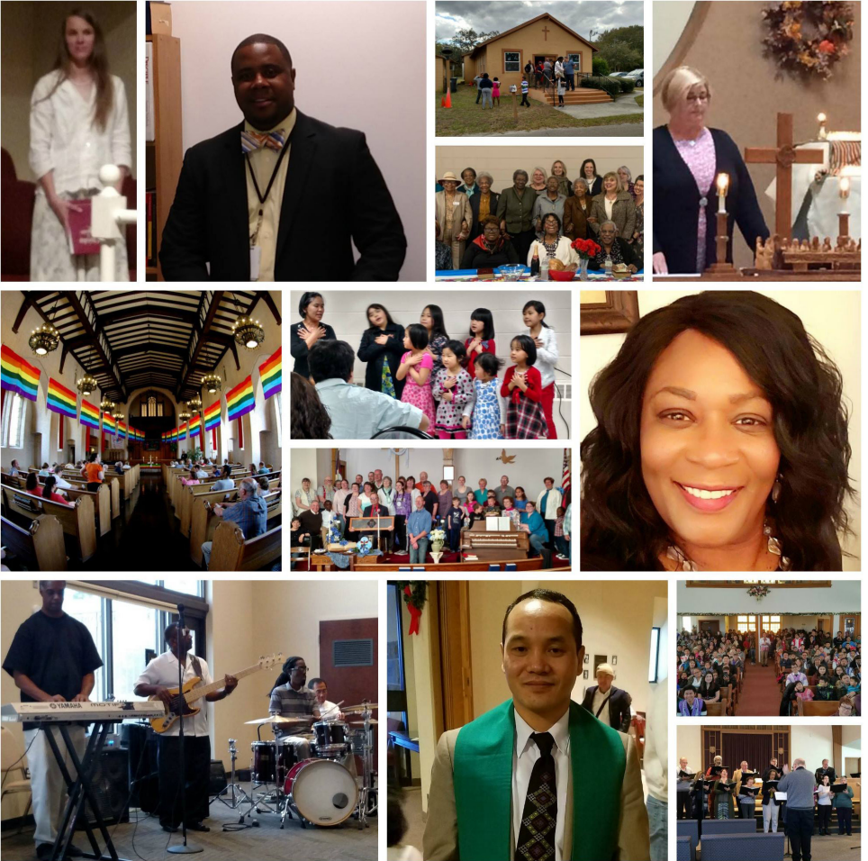
Pictures above represent some churches, pastors, and members of the diverse ABC of Rochester/Genesee Region family.